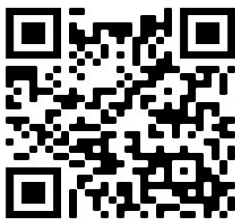
QR Code for Hospital Location